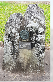
First Richmond River Crossing (1840)