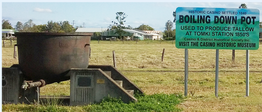
Boiling Down Pot (1840).

Each monument, located at various spots, has local historical significance and was supplied by Casino Historical Society.