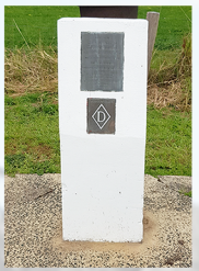
Wooroowoogan Cattle Station (1842-1970)